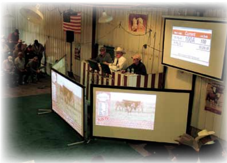
— K&B Dispersion last fall —

Video auctions we conducted last year included: K&B, Rausch, Blacktop, Bieber Red Angus and Thorstenson. Videos were also shot at Stuber Ranch, Fawcett Herefords, Delaney Herefords, Atkins Herefords, Thorstenson Herefords Friedt Herefords, Gray's Angus, Sandhill Farms, Tegtmeier Polled Herefords, Bischoff's Ravine Creek Ranch, Ehlke Herefords, McMurry Cattle, Jamison Herefords, Rausch Herefords, Carmichael Herefords, Curtis Polled Herefords, Blacktop Farms, Pyramid Beef, Cornhusker Classic Steer & Heifer Show, DeanaJak Farms, Baumgarten Cattle Co., Dvorak Herefords, Spruce Hill & Wicks Cattle Co.