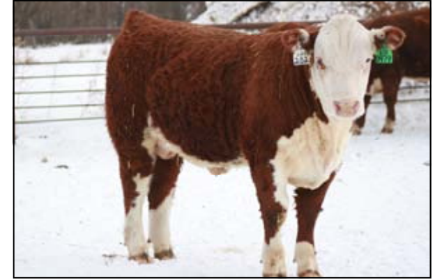
CKP MAGNA 0979 ET

THIS BULL SHOWS THE ADDED DIMENSION THE MAGNUMS EXHIBIT. OUT OF ONE OF THE TOP CARCASS BULLS IN THE BREED BWT: 94 SIRE: SPEARHEAD MAGNUM P28 MGS: STAR SS THUNDER LT 62J