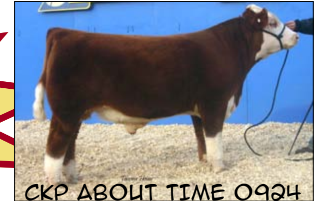
CKP ABOUT TIME 0924 A REALLY DEEP PRETTY FRONTED BULL. FLASHY AND WELL PUT TOGETHER OUT OF A 2 YR OLD GIT-R-DONE DAM.

CALL FOR INFO ON CAMERA SHY 0902 & 0920, YOU'LL AGREE IT'S... ABOUT TIME!