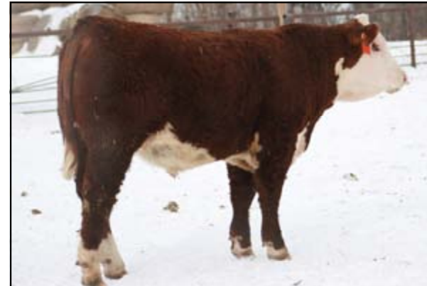
CKP ABOUT TIME 0941

LONG FRONTED, LONG BODIED ABOUT TIME SON. HIS DAM HAS PRODUCED HERD BULLS FOR AMOS HEREFORDS AND K&M CATTLE BWT: 92 SIRE: CRR ABOUT TIME 743 MGS: HAROLDSON'S DRUMMOND 566