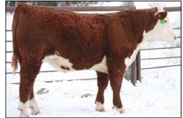
CKP MAGNA 0986 ET

FULL SIBS TO THE SUPREME CHAMPION HEIFER PEN AT THE NORTHSTAR CLASSIC, OUT OF A VERY POWERFUL DONOR COW BWT: 93 SIRE: SPEARHEAD MAGNUM P28 MGS: STAR SS THUNDER LT 62J