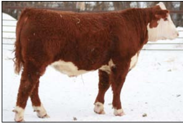
KAIN ABOUT TIME 0904

A DEEP RIBBED ABOUT TIME SON IS SOGGY AND SHORT MARKED WITH EYE PIGMENT. GOES BACK TO KODIAK, SOLID CARCASS BWT: 88 SIRE: CRR ABOUT TIME 743 MGS: VCR EAST KODIAK 506E