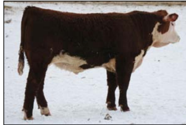
CKP DUST 0960

THE DUSTERS ARE A STYLISH GROUP OF BULLS, HE IS NO EXCEPTION, EYE PIGMENT, VERY GOOD GROWTH IN THIS BULL BWT: 91 SIRE: NJW 139J DUSTER 47P MGS: SB 122L PRIDE LINE 32N ET