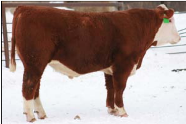
CKP ABOUT TIME 0921

MEAT WAGON, LOTS OF GUTS, LOTS OF MUSCLE SHAPE, SOGGY, EYE PIGMENT, FANTASTIC MATERNAL IN THIS BULL BWT: 86 SIRE: CRR ABOUT TIME 743 MGS: CFR ADM LAD 715 1 ET