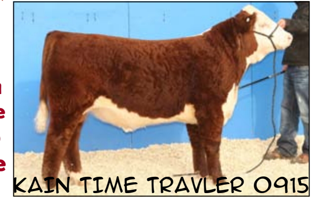
KAIN TIME TRAVLER 0915 TOP END HERD SIRE PROSPECT, HE'S A BIG DEEP RIBBED BULL WITH LOTS OF MUSCLE SHAPE. VERY LONG BODIED BULL WITH A CLEAN FRONT END.

Duster Magnum Git-r-done Sons also Available