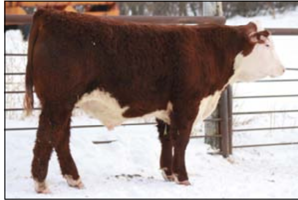
CKP DUSTIN 0950

THIS IS A VERY STYLISH BULL. ONE OF THE TOP PUREBRED HERD BULL PROSPECTS. DEEP QUARTER AND DEEP RIBBED BWT: 85 SIRE: NJW 139J DUSTER 47P MGS: SB 122L PRIDE LINE 32N ET