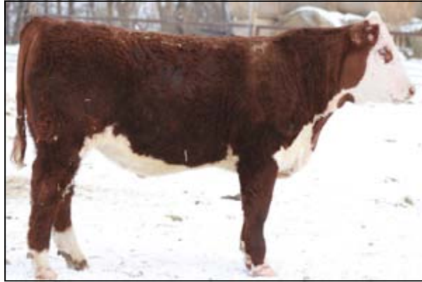
KAIN ABOUT TIME 0909

PRETTY FRONTED, CALVING EASE BULL WITH PERFORMANCE, SOUND STRUCTURE, WELL PUT TOGETHER, WITH PIGMENT BWT: 72 SIRE: CRR ABOUT TIME 743 MGS: SB 122L PRIDE LINE 32N ET