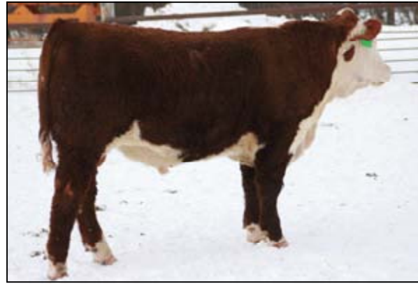
CKP KH SHAITAN 0923

EXTRA LONG AND DEEP, WILL ADD LOTS OF POUNDS, OUT OF A SUPER MATERNAL COW, CAN EASILY WORK ON REGISTERED COWS BWT: 85 SIRE: NJW 139J DUSTER 47P MGS: JDB 517 BARITONE 616