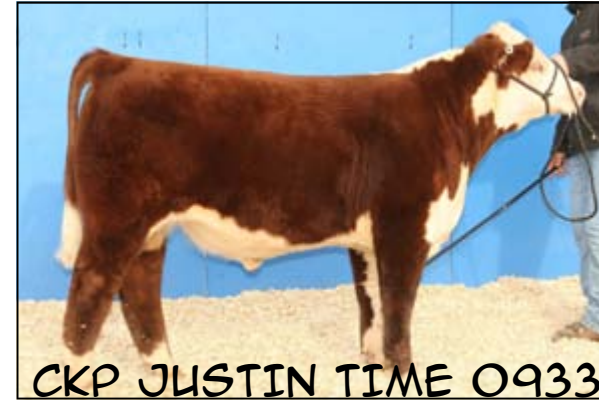
CKP JUSTIN TIME 0933 THIS BULL RECEIVED SIGNIFICANT ATTENTION IN DENVER! AN EXCEPTIONAL BULL. SEMEN PACKAGES AND AN INTEREST FOR SALE. HE WILL BE USED HEAVILY IN OUR HERD.