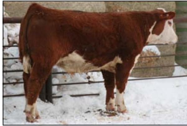
KAIN ABOUT TIME 0908

HERE'S ONE OF THE HEIFER BULLS OF THE GROUP. SUPER FRONTED, EXCELLENT NUMBERS, SUPER LONG, WITH PIGMENT BWT: 73 SIRE: CRR ABOUT TIME 743 MGS: SB 122L GIT-R-DONE 19R ET