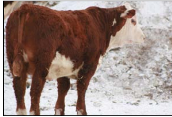
CKP DUSTED 0964

EXCELLENT NATURAL THICKNESS AND MUSCLING, A DEEP SOGGY BEEF BULL THAT WILL ADD POUNDS TO A SET OF CALVES BWT: 81 SIRE: NJF 47P STARBUCK 102S MGS: CJH HARLAND 408