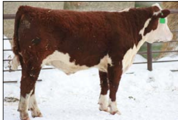
CKP MAGNA 0985 ET

FULL BROTHER TO 0967, 0979 AND 0986, THESE ARE A CONSISTENT BUNCH OF BULLS, THE LONG SHARP FRONT ON THESE BULLS BWT: 102 SIRE: SPEARHEAD MAGNUM P28 MGS: STAR SS THUNDER LT 62J