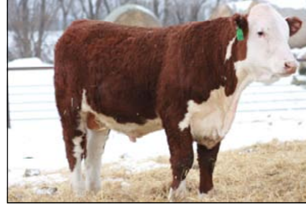
KAYLA ABOUT TIME 0910

A GOOD STOUT ABOUT TIME BULL. SOLID MUSCLE SHAPE, HIGH GROWTH POTENTIAL, LOTS OF PERFORMANCE BWT: 98 SIRE: CRR ABOUT TIME 743 MGS: VCR EAST KODIAK 506