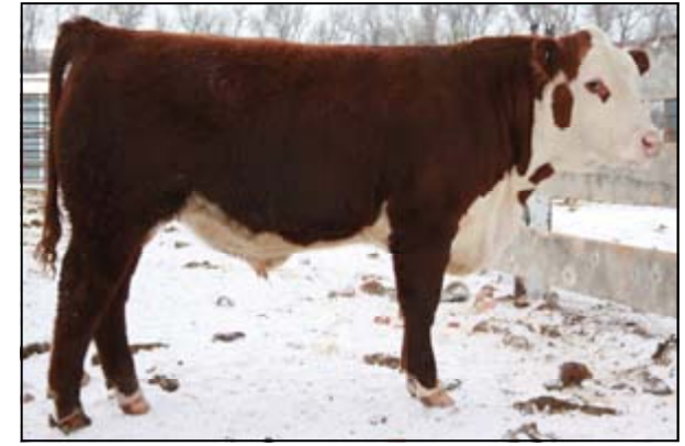
CKP PROGRAM 0907

INTEREST FOR SALE ON THIS BULL. HE WILL BE USED IN OUR HERD TO CONTINUE TWO VERY SUCCESSFUL SIRE BLOODLINES BWT: 82 SIRE: SB 122L GIT-R-DONE 19R ET MGS: VCR EAST KODIAK 506E