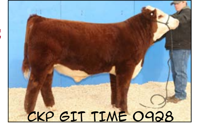
CKP GIT TIME 0928 A POWERFUL INDIVIDUAL. A BIG SHORT MARKED BULL WITH EXTRA LENGTH, LOTS OF THICKNESS. BEAUTIFUL HIP AND HIND QUARTER. OUT OF A 2 YR OLD GIT-R-DONE DAM.