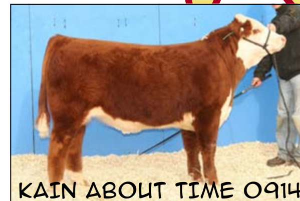
KAIN ABOUT TIME 0914 HEIFER BULL PROSPECT, LIGHT BIRTH WEIGHT DEEP BODIED BULL WITH AMPLE THICKNESS, EXCELLENT LENGTH OF BODY, AND AN NICE HIND QUARTER.