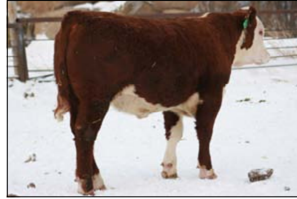
CKP MAGNET 0967 ET

A NICE STYLISH BULL WITH AN OUTCROSS PEDIGREE, GOOD THICKNESS THROUGHOUT, VERY CLEAN FRONTED BULL BWT: 83 SIRE: SPEARHEAD MAGNUM P28 MGS: STAR SS THUNDER LT 62J